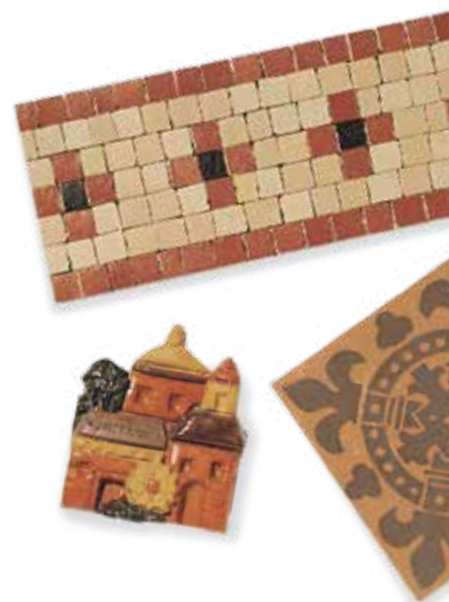
LEFT A handful of British and American companies make glazed tiles similar to these Aesthetic tile panels in a Victorian mansion. RIGHT Square mosaics, a Moravian Brocade deco, and an encaustic floor tile.