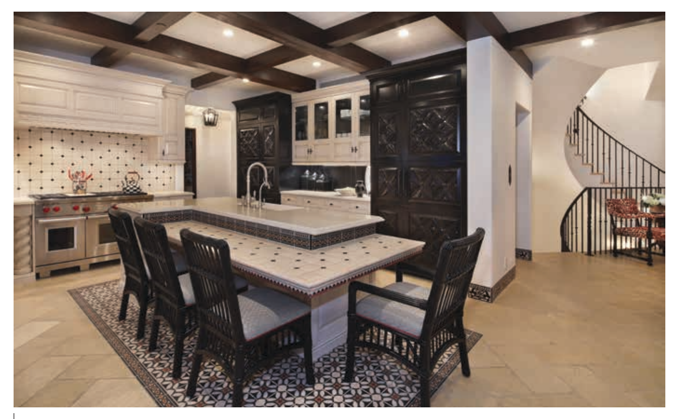
The 6- x 6-inch "Medieval Creatures" design continues throughout the house as the shoe molding for the walls in the main living areas and master bedroom, while a "tile rug" was created for the kitchen floor using a 6- x 6-inch version of the "Jay #4 Medallion" bordered by 3- x 6-inch tiles from the "New Helix" design, which were also used on the island.